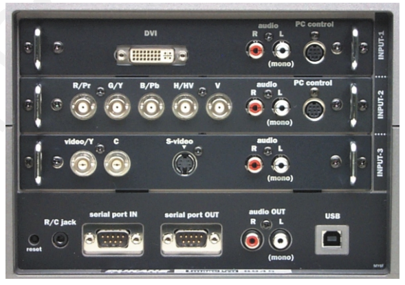
The ImagePro 8945 input modules are easily accessible.

venue events. It has connection modules for virtually any standard computer or video signal including all the modes of HDTV. With a 700:1 contrast ratio and progressive signal processing, an outstanding image is assured. A movable lens and digital keystone correction provide additional flexibility, plus dual lamps assure continuous operation throughout any presentation. It can be permanently installed in rear screen, ceiling or raised mountings, and where necessary, optional user replaceable lenses can be installed in minutes.